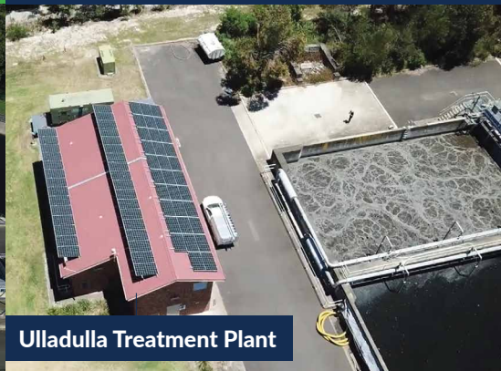
Ulladulla Treatment Plant