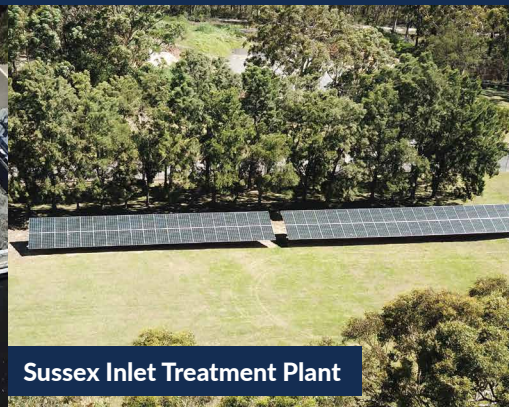
Sussex Inlet Treatment Plant

As Australia's leading energy-saving partner, we enable businesses, education, healthcare, and government facilities to achieve sustainability and energy efficiency through LED lighting upgrades, solar and embedded energy solutions.